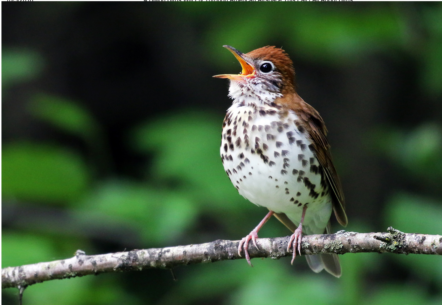
Wood Thrush populations are down 60 percent since 1970.

The numbers from this study provide a measure of year-to-year bird survival. By comparing the number of birds moving back and forth each autumn and spring, researchers were able to determine an average annual return rate. For birds crossing the U.S. northern border—which includes many short-distance migrants such as sparrows, Snow Buntings, and Dark-eyed Juncos that fly from Canada to spend winter in the Lower 48 states—the average rate of return was 64 percent. But for birds crossing the U.S. southern border—which includes more of the long-distance migrants such as warblers, tanagers, and orioles that travel to Central and South America, three to four times farther than the short-distance migrants—the average rate of return was 76 percent.